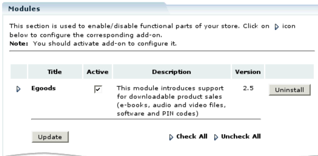
Figure 2: Egoods module installed

To deactivate the module, unselect the 'Active' check box against the module title and click on the ' Update ' button. To completely uninstall the module, click on the ' Uninstall ' button.