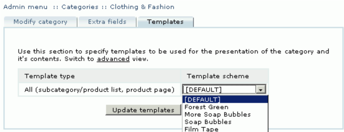
Customizing category appearance using simple mode