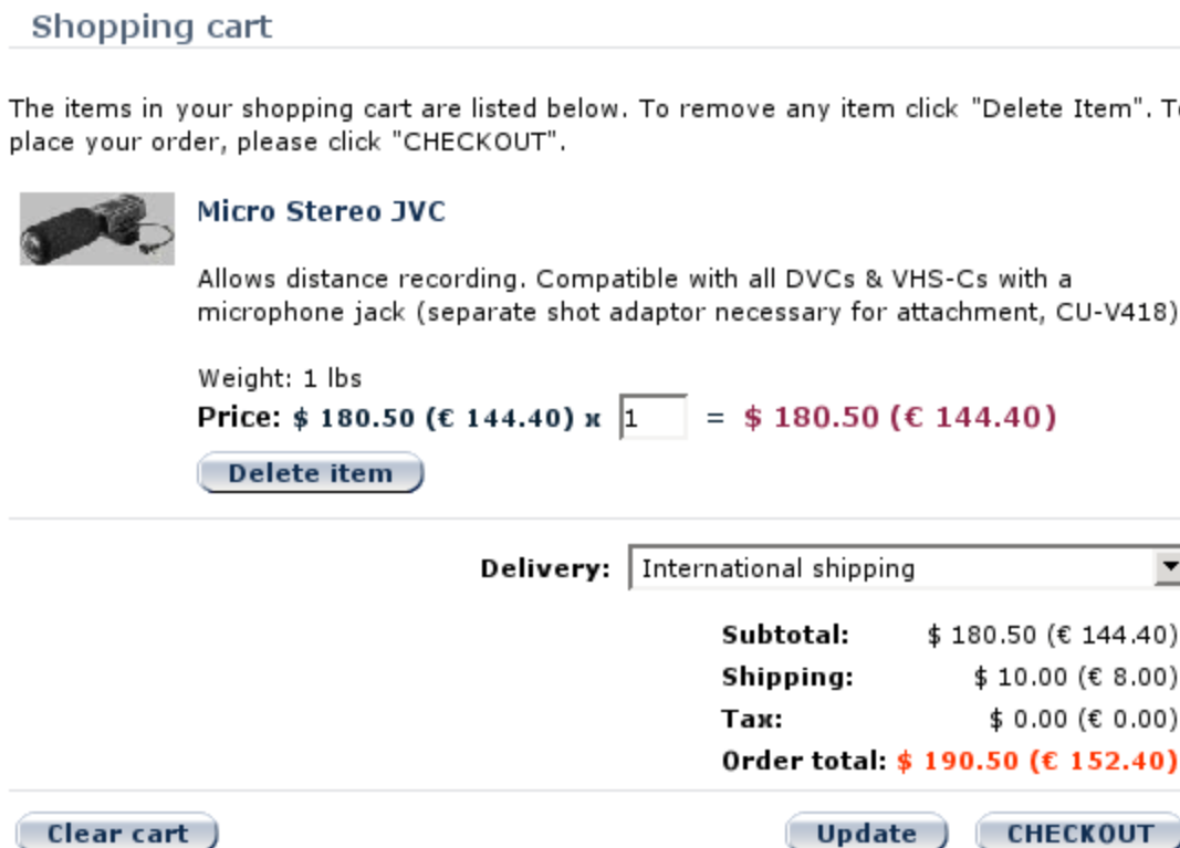
Figure 9: Shopping cart as seen by a customer from Austria

If we do not limit the list of currencies to only national and default currencies, all available currencies will be displayed (Figure 11).