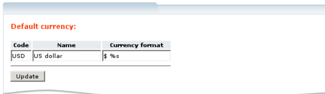
Figure 4: Modifying default currency